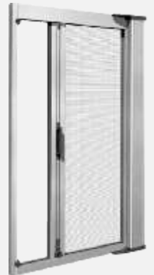
Pleated Single Mesh