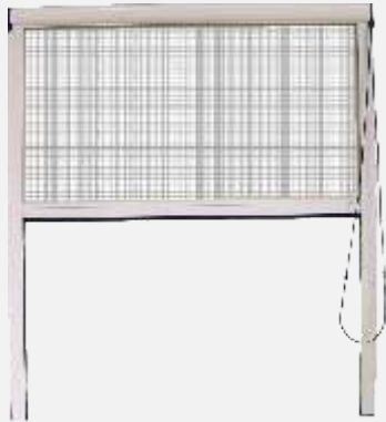
Zig Zag Vert