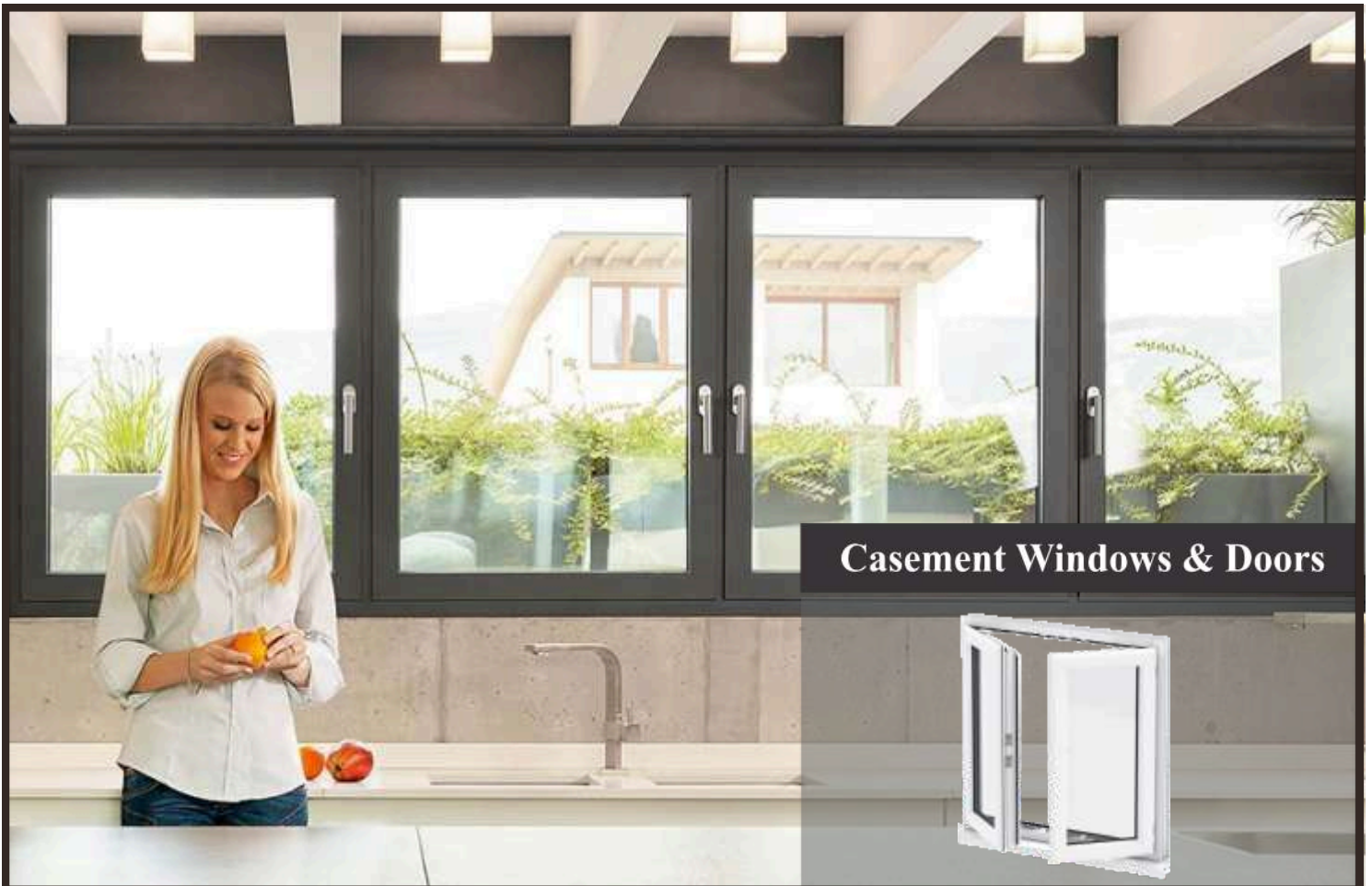
Casement Windows & Doors