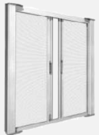
Pleated Double Mesh