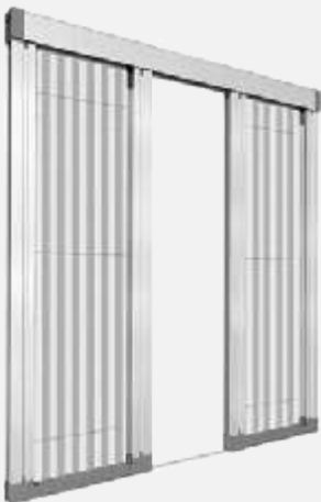
Barrier Free Mesh